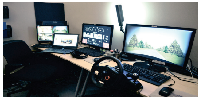
Figure 2: The simulator’s Wizard of Oz operator control station.

Within the same room, but outside of the view of participants, a small control station, shown in Fig. 2, permits experimenters to observe and engage participants. This study had two primary channels of interaction: spoken dialog and autonomous driving behavior. Its operation therefore required two experimenters—one who engaged participants using a text-to-speech system that spoke aloud text that was typed into a laptop, and one who controlled the actions of the car when it was in autonomous mode using a game controller complete with pedals, steering wheel and column levers.