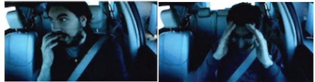
Figure 1: Participant vocalizes his fear (left) and covers his eyes (right) as the car drives off of the road.

In experimental settings within automotive simulators, establishing dialog can not only allow designers to prototype speech interfaces for automobiles, but also can be used as an instrument to find out what drivers might be concerned, confused or curious about during the course of an drive, matters that a smart system would likely want to