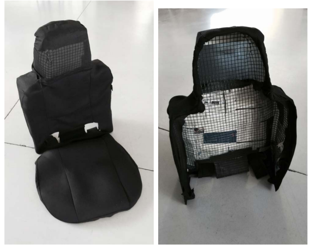
Fig. 2. The seat cover costume was sheer so that the driver could see through, and had arm outlets so that the driver could steer the car.

a) Motivation for hiding the driver: The main challenges of putting an autonomous vehicle in the wild are regulatory and safety related issues. We were therefore interested in observing how pedestrians would respond to an autonomous vehicle in the wild. However, we selected to use a faux driverless vehicle rather than one that could actually navigate by itself. Besides the technical challenges of implementing a fully autonomous car, Californian law does not allow completely self-driving (i.e., driverless) cars on public streets yet. While the California Department of Motor Vehicles (DMV) issues licenses for testing autonomous technology, regulations require that a human operator sits in the driver seat at all times to take over in an emergency or when the autonomous technology is turned off [27]. This means that any present-day self-driving car with functional autonomous technology must have a human operator in the