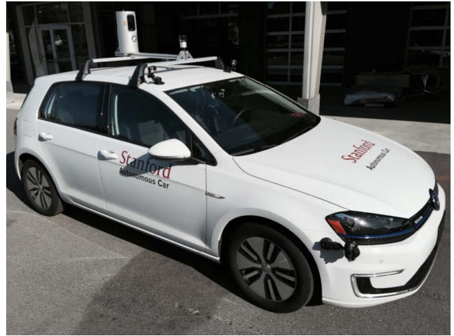
Fig. 1. GhostDriver features a hidden driver to simulate an autonomous vehicle in field experiments with pedestrians and cyclists.

In this paper, we outline a novel method for investigating interactive behavior patterns between pedestrians and driver-