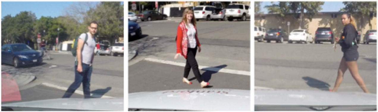
Fig. 4. Participants walking in front of the Wizard-of-Oz self-driving car looking for a driver.

signals to point to and interact with individuals? One main insight of this paper is that overlooking the effect of novelty, people generally adhered to existing interaction patterns with cars unless there was a breakdown in expectations. We found that while erratic behavior on the part of the car was mentioned as a reason for hesitancy, the decision to cross was still made by most participants.