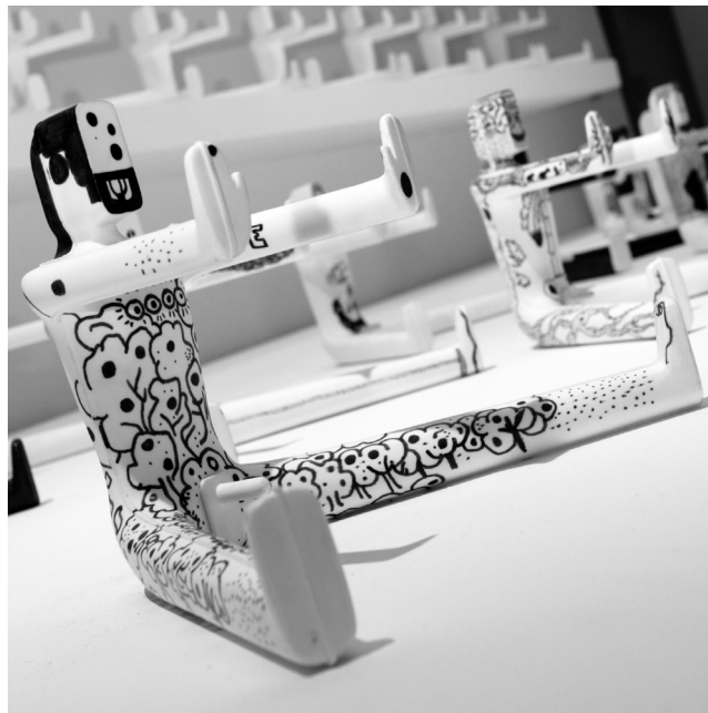
Figure 18.6 Dunne and Raby’s ‘Evidence Dolls’ challenged exhibition visitors to think about the future of genetic engineering.

Our concept of ‘place’ in research through design does not imply a particular philosophical stance. We intentionally separate the methodological concerns of the research setting from the philosophical stance imposed on design artifacts (see ‘point-of-view’ below). This distinction is notably different from Koskinen and colleague’s concept of showroom-based RtD, where designers apply critical theory and pragmatist philosophy and introduce artifacts to galleries and public