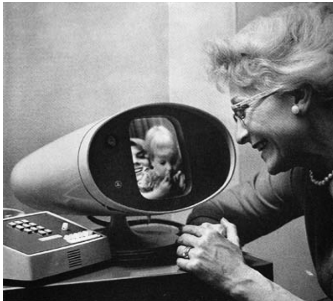
Figure 18.A An advertisement for the Bell Picturephone (developed at Bell Laboratories, a subsidiary of Alcatel-Lucent).

The public's first contact with a working telepresence technology was Bell Laboratories' Picturephone at the 1964 Seattle World's Fair (see Figure 18. A). Callers could sit in telephone booths with small monitors and have a video-based conversation with a stranger in another booth. The Picturephone represented a breakthrough design intended to transform communication in daily life. Ahead of its time, the Picturephone was discontinued by 1970. In 1968, Douglas Englebart's oNLine System demonstrated remote collaboration in a utopian view of interactive computing and also represented an early breakthrough in the evolution of telepresence (Englebart 1968).