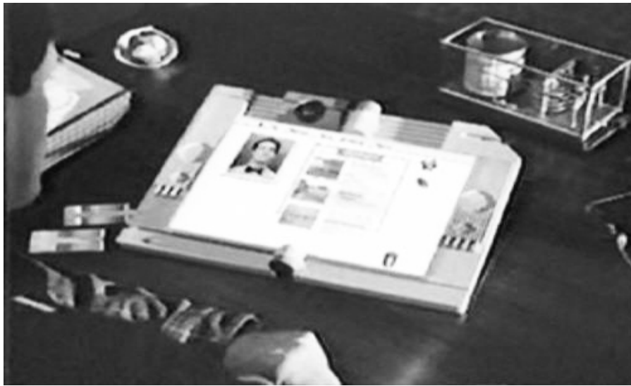
Figure 18.8 Apple's Knowledge Navigator video presented a utopian vision of how people could one day interact with intelligent agents.

Utopian perspectives get traction when accompanied by a concrete prototype (Schrage 1996). For example, the Tivoli/Liveboard project at Xerox PARC created a utopian vision of workplace meetings where a smart whiteboard not only enables people from remote sites to share a view of a common written space, but also enables groups to get rid of the mildly subservient 'notetaker' role (Moran et al. 1998; Pedersen et al. 1993). The systems sought to clarify the human-oriented value proposition well before the underlying technologies permitted these ideas to be tractable in the consumer market.