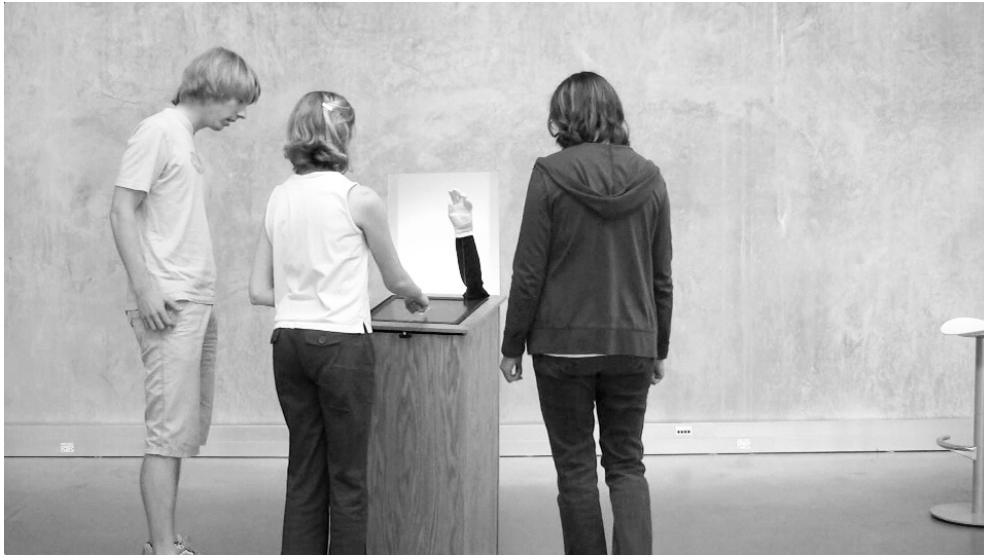
Figure 18.5 Ju and Sirkin's 'waving hand' kiosk explored greeting dynamics in public settings.

Gaver et al. articulated 'we don't emphasize precise analyses or carefully controlled methodologies; instead, we concentrate on aesthetic control, the cultural implications of our designs, and ways to open new spaces for design' (Gaver, 1999). By placing designs in context, design researchers can generate theory by reflecting on observations of use.