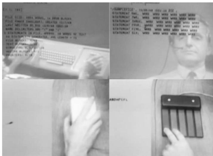
Figure 18.7 Engelbart’s oNLine System demonstrated a vision of ‘augmenting human intellect’ that had a profound influence on the field of human–computer interaction.