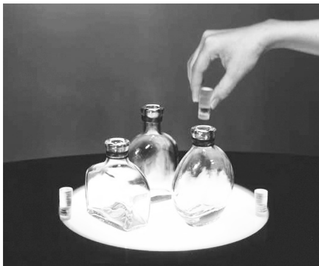
Figure 18.4 Ishii's musicBottles extended Bishop's concept of using tangible objects to control digital audio.