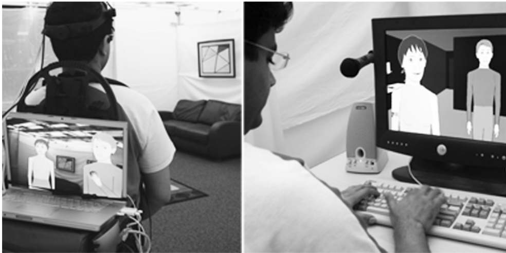
Figure 18.2 Dow and colleagues conducted semi-controlled lab studies with different interfaces to the interactive drama Façade .

deductive reasoning to predict outcomes based on theory (Creswell & Clark 2006). Design researchers, on the other hand, use abductive reasoning to conjecture a probable future based on an incomplete set of observations (Kolko 2011; Peirce 1998). They ask ‘what-if questions’ based on a set of ideals and agendas (Fallman, 2003). By focusing on the possibilities that arise from some future design (Moggridge 2007), design researchers are bound to different epistemological commitments than pure ethnographic field studies, traditional psychology experiments, or other research approaches, such as simulation or historical perspectives (Axelrod 1997; Wyche et al. 2006).