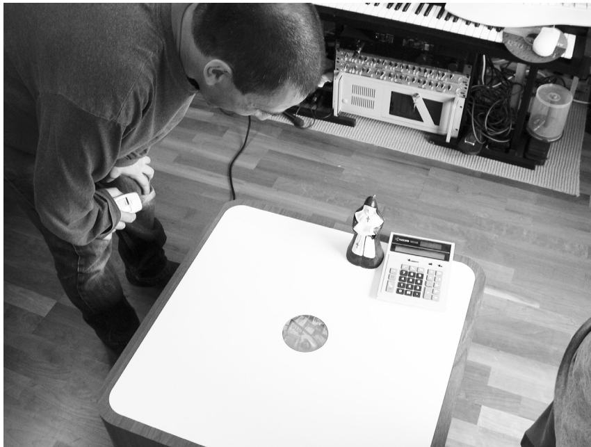
Figure 18.1 Gaver's Drift Table exemplifies research through design.

artifact, an electronic coffee table with a tiny display of aerial photography that moves slowly based on the weight distribution on its surface (Gaver et al. 2004) (see Figure 18. 1). Gaver and his colleagues were not interested in whether people wanted to buy the Drift Table. It was never intended to be widely adopted or commercially viable, but rather, to serve as an object of inquiry. This provocative artifact helped Gaver and his colleagues to investigate non-routine household activities and 'ludic' emotions, such as curiosity and reflection.