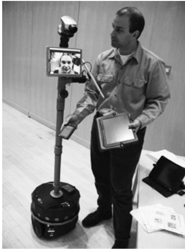
Figure 18.B Paulos's 'Personal Roving Presence' (PROP) embedded telepresence technology atop a physical rover.

With sufficient point design exploration, research through design within this domain could focus on understanding how key variables affect the human experience of telepresence. Olson and Olson examined face-to-face collaboration to enumerate key characteristics that an ideal telepresence system would have to support communication, such as rapid feedback, immediate corrections, multiple communication channels and shared local context (Olson & Olson 2000). Hollan and Stronetta push back against the always-on face-to-face inevitability of telepresence to suggest there are objectives "beyond being there" that would suggest lower cost, more ephemeral, more anonymous forms of telepresence (Hollan & Stronetta 1992). Extending this notion, Carroll et al. (2006) explored how to support activity awareness that transcends moment-to-moment social interaction, providing both co-located and remote collaborators a "common ground" to enhance understanding of each other's activities.