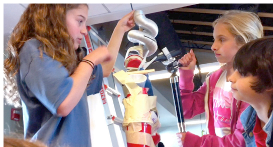
Figure 3. Students aligning IR light with Wii IR camera on their rollercoaster track.

The school year concluded with a marble rollercoaster activity, also a common project in middle school science classrooms. Studying kinetic and potential energy, students built a marble rollercoaster (Figure 3) within specified constraints. Using their knowledge of the workings of the gaming system, and infrared LEDs and IR cameras from game controllers, they developed systems to track the marbles velocity at different points along the track.