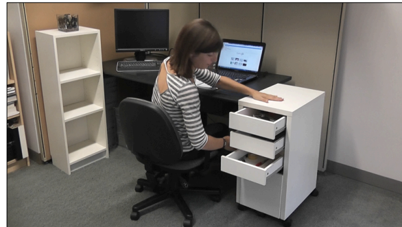
Figure 1: On the left (a) is an actor and designer improvising with the robotic ottoman. Its movement mechanism is concealed just below the frame. On the right (b) is a video prototype of the emotive robotic drawers responding to being tickled by a confederate actor.