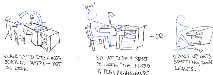
Figure 3: Excerpt of a storyboard for the robotic drawers. The storyline shown anticipates the viewing angle and action that we used in subsequent video prototypes (shown above).